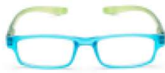
NEKTIE AED 150.00