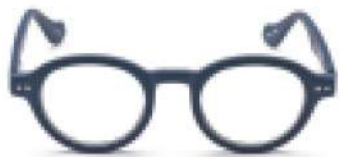
LEONARDO AED 150.00